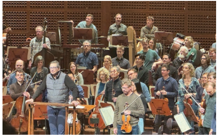
Residents attended Open Rehearsal at the SF Symphony on January 25th where Michael Tilson Thomas conducted for one of the last times!

Music is also alive and well in San Francisco. There is a wonderful program