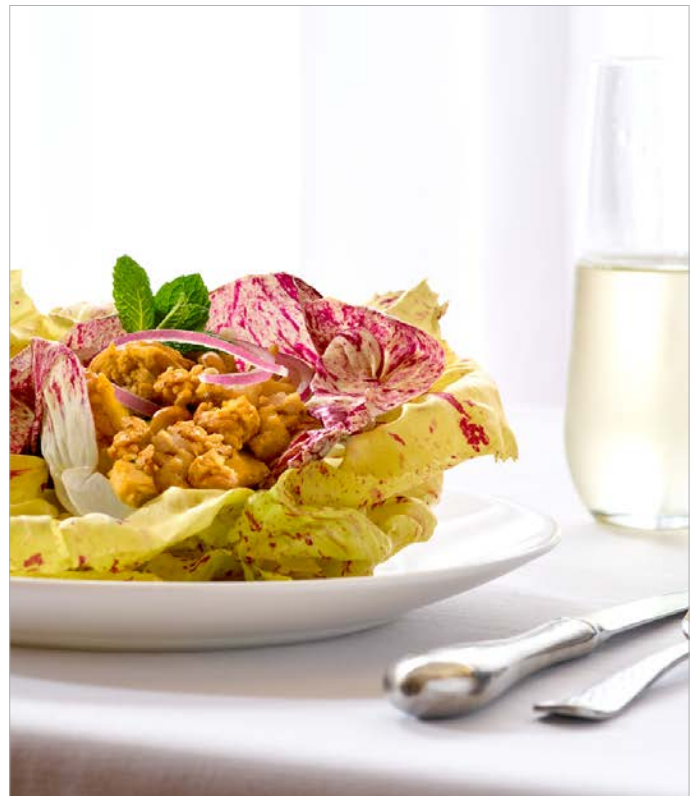
Chicken Salad. Yes, please.