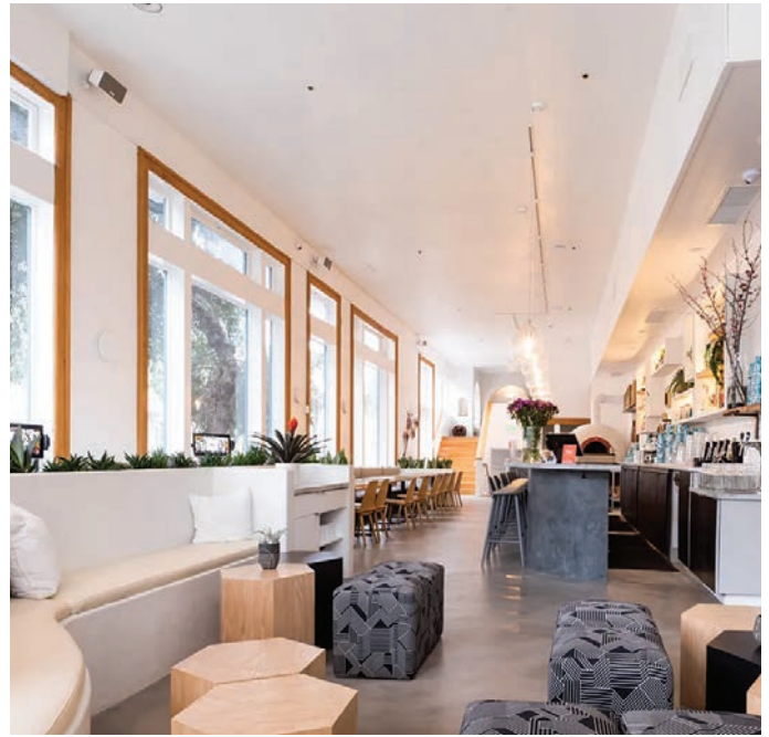
Interior of Noosh Restaurant on Fillmore.