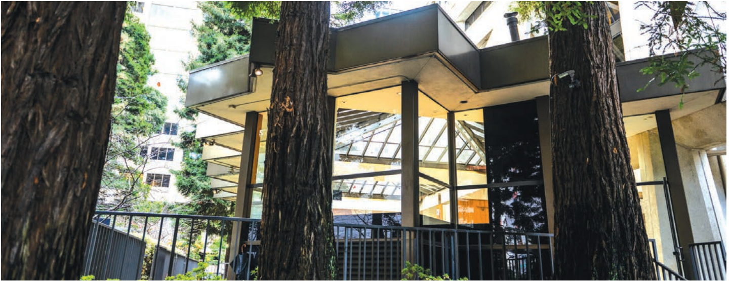
A grove of redwood trees grows at the base of the Transamerica Pyramid in San Francisco on Dec. 6, 2022.