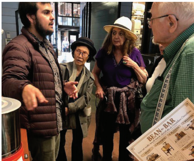
Residents learn about the process of making chocolate at Dandelion Chocolate Factory.