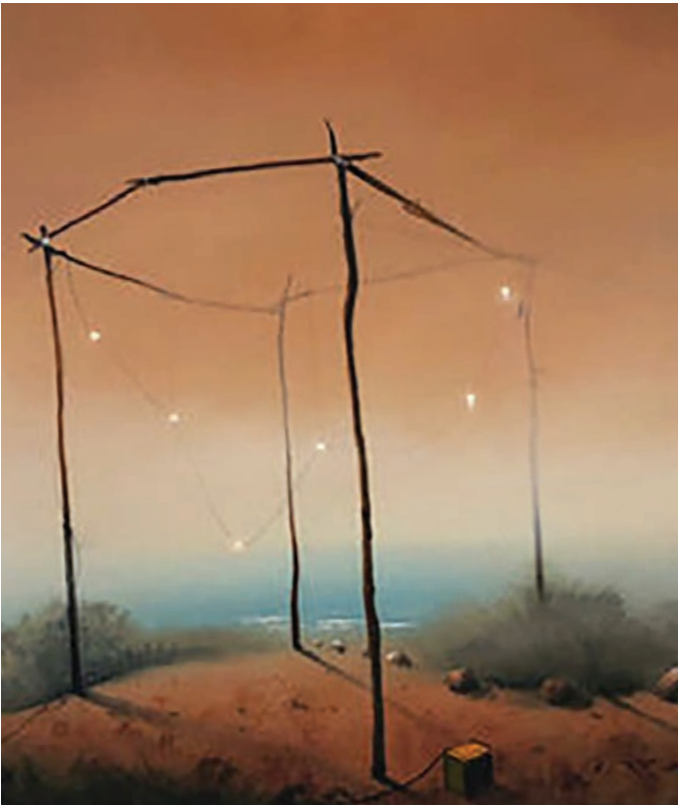
Tom Gehrig, "Proposal for a New Constellation, 20" x 48", oil on canvas with mixed media.