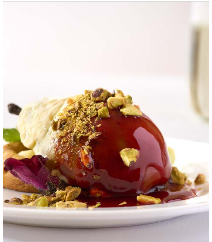
Pear with cherry sauce. Yum.