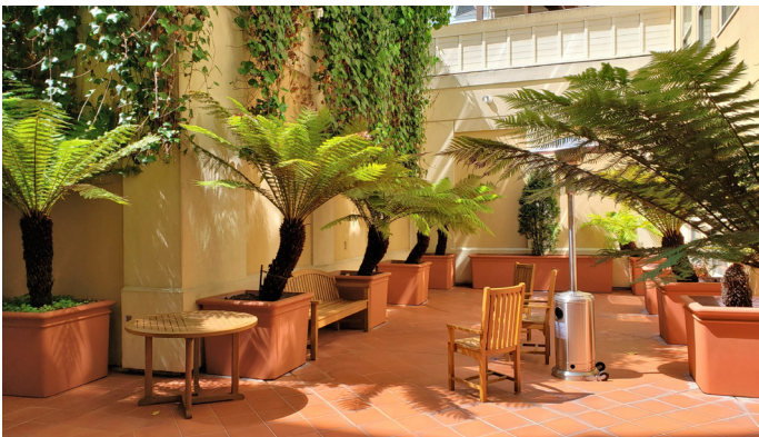
Image: Fern Court at RGP.

We have the privilege to bear witness to special moments for our residents and their loved ones, and these moments are one of the great joys of our community.